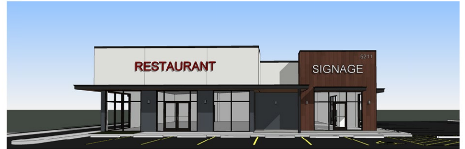
4 NORTHWEST VIEW SCALE