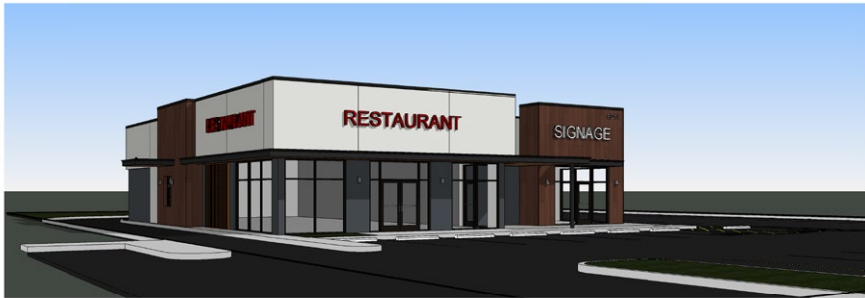
1 NORTH VIEW SCALE