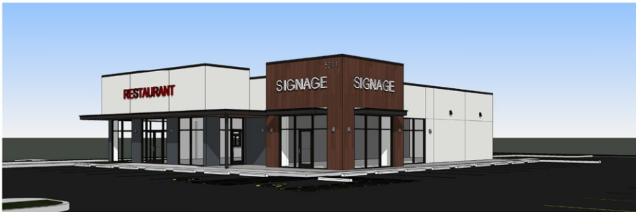
3 WEST VIEW SCALE