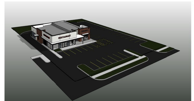
6 BIRD'S EYE VIEW SCALE

Kevin Clements / KEVIN@SHOPCOMPANIES.COM / 210-985-7291