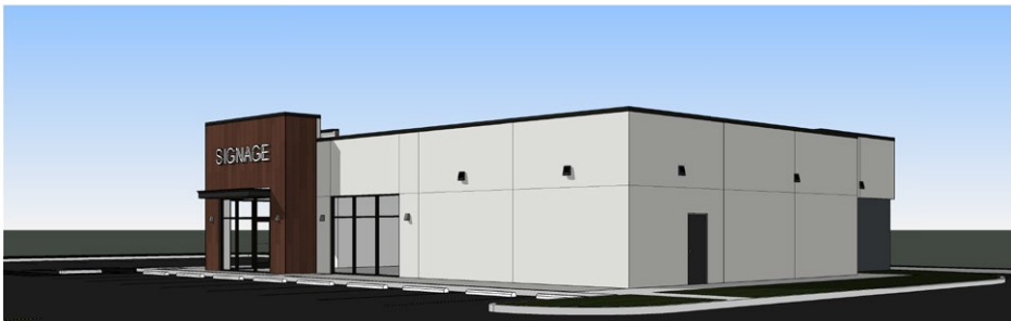
5 SOUTH VIEW SCALE