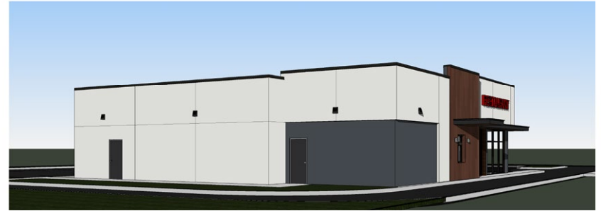
2 EAST VIEW SCALE